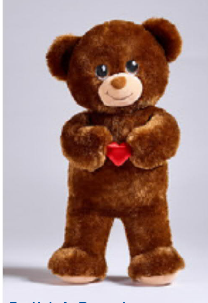
Build-A-Bear becomes a multi-generational brand that is recognized by and connected to consumers globally.